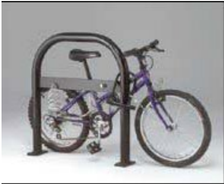
Inverted U Type Bicycle Rack