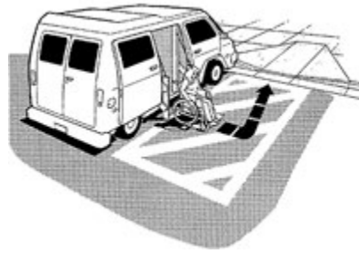
TABLE 10-8-6 (A) ILLUSTRATION SHOWING A VAN WITH A SIDE-MOUNTED WHEELCHAIR LIFT

The illustration above shows a van with a side-mounted wheelchair lift lowered onto a marked access aisle at a van-accessible parking space. A person using a wheelchair is getting out of the van. A dashed line shows the route from the lift to the sidewalk.