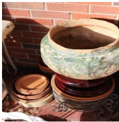
Flower pots & saucers