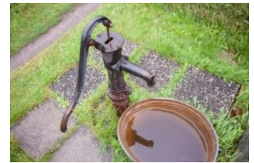
Water from leaky faucets