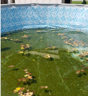
Neglected swimming & wading pools

Wherever water collects, mosquitos can breed.